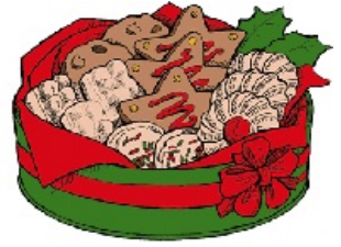
Christmas Shut-in Project

COOKIES ARE NEEDED FOR OUR CHRISTMAS SHUT-IN PROJECT. Our Homebound Members are so appreciative of receiving a box of Christmas cookies and being remembered by their church family at this special time of year. Please bake 3-4 dozen cookies (or whatever your recipe makes) to fill the festive boxes decorated by our Sunday School. No peanut butter cookies please (as they flavor all the other cookies). Please bring the cookies to church by 10:30 a.m. on Friday, December 2 nd – they can be put in the church's freezer ahead of time but make sure to label them for "Shut-In Project."