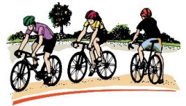
Bike Trip for Isaiah House

The LYO raised $945 for Isaiah House. Unfortunately, the weather did not cooperate and we were not able to complete the Bike Trip. However, we will do the trip in the spring, as soon as the weather clears. The $945 has been sent to Isaiah House!